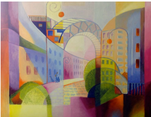
Paintings and sections of paintings used in this brochure are by Tuggerah Lakes Art Society members.

*Members that wish to receive the newsletter via post need to add $15 to the membership fee. This partly covers the cost of postage and printing.