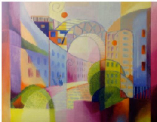
Paintings and sections of paintings used in this brochure are by Tuggerah Lakes Art Society members.

Each month members receive a copy of the Newsletter. This keeps you up to date with the Society's news, reports, upcoming events including exhibitions and the yearly program.