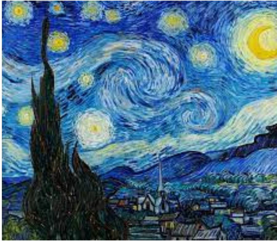
"The Starry Night" Vincent Van Gogh - June 1889

Section 1 - A Fab Fake which is an exact copy of an original painting by an artist who has been deceased for over 70 years.