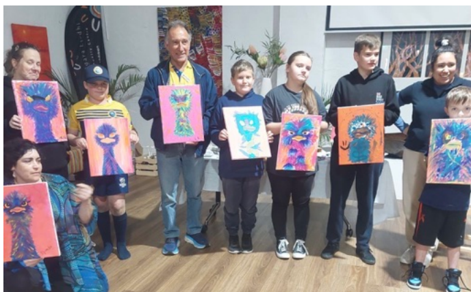
Some of the amazing emus that were created during the workshop.