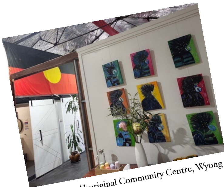
Part of the Aboriginal Community Centre, Wyong

This workshop was held at the Aboriginal Community Centre in Wyong and was for students 8-14, but some of the adults popped in to check and stayed to paint!