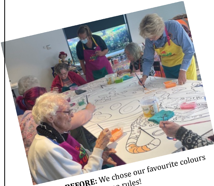
Photo BEFORE: We chose our favourite colours and painted away .. no rules!

The mural will be donated and installed at the Walkabout Wildlife Park.